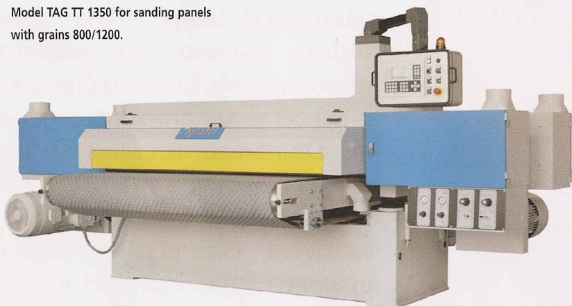
Model TAG TT 1350 for sanding panels with grains 800/1200.

builder, from the profiles and frames producers to the suppliers of rough and lacquered panels.